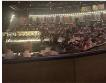
The buffet at "Beef and Boards"