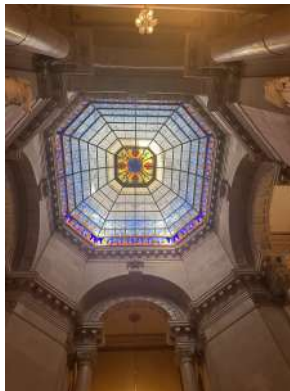
The chapel in the State House