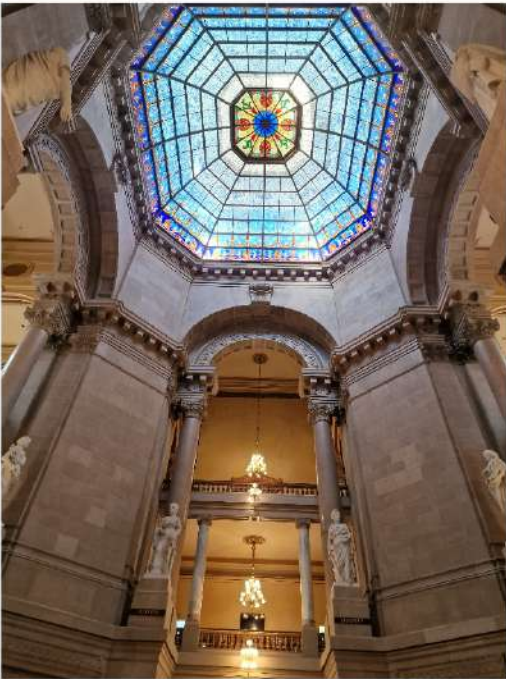
The state house