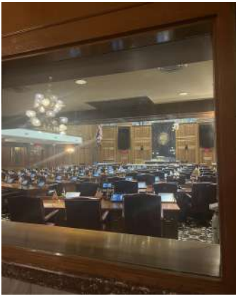
The meeting room