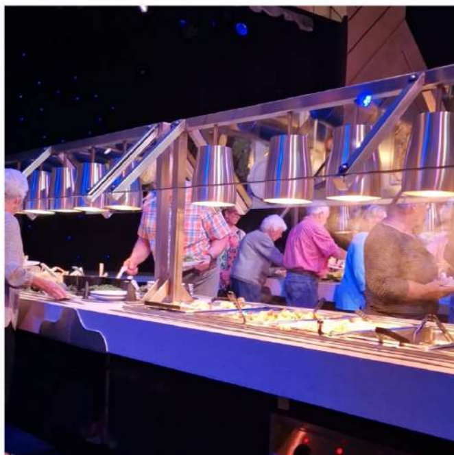
Buffet at "Beef and Boards"